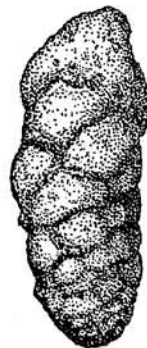
Fig. 1. Paratype specimen of " Gaudryina " cuvierensis Holbourn & Kaminski, 1995; sample 263-22-3, 117–121 cm.; x 30

Stratigraphic distribution: Lower Cretaceous (probably Hau-